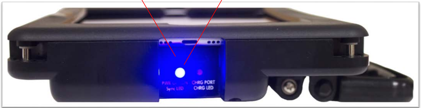
Power OFF/ON Switch Bluetooth LED